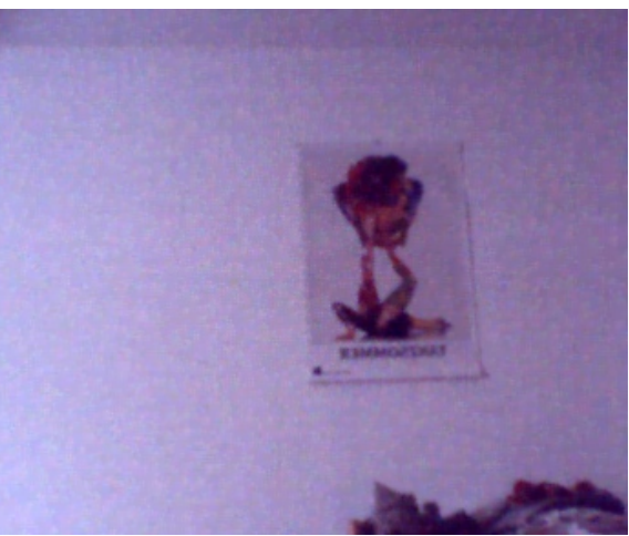
Figure 5 Result after distortion removal

Remove the distortions with optical calibration. (Figure 5)